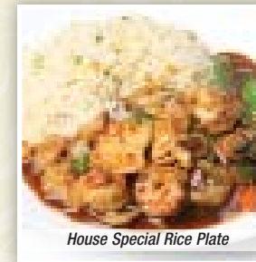
House Special Rice Plate