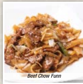
Beef Chow Fun