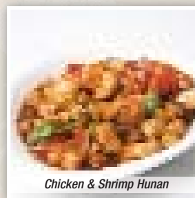
Chicken & Shrimp Hunan