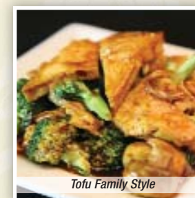
Tofu Family Style