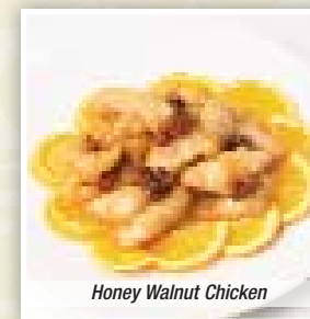
Honey Walnut Chicken