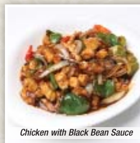
Chicken with Black Bean Sauce