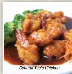
General Tso's Chicken