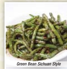
Green Bean Sichuan Style