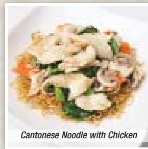
Cantonese Noodle with Chicken