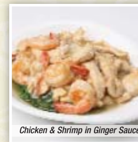
Chicken & Shrimp in Ginger Sauce