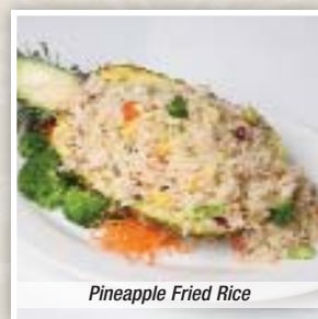
Pineapple Fried Rice