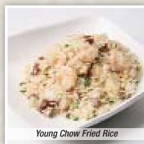
Young Chow Fried Rice