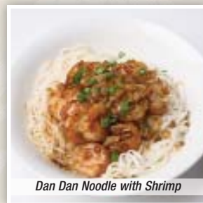
Dan Dan Noodle with Shrimp