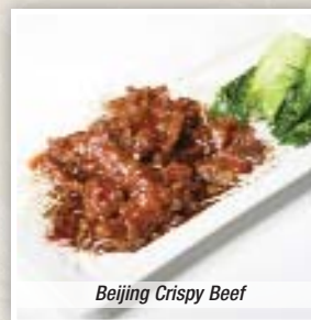
Beijing Crispy Beef