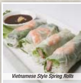
Vietnamese Style Spring Rolls